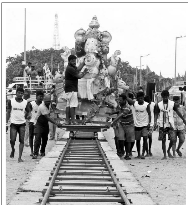
For the first time in Chennai, the Ganesha idols that were placed in various parts of the city for Vinayagar Chaturthi festival were immersed in Pattinapakkam with the help of trolleys.